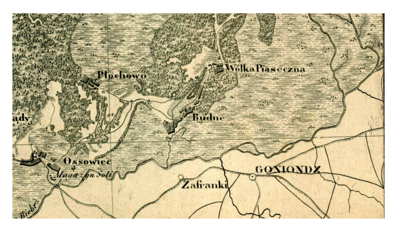
Fig. 3. Biebrza River in the vicinity of Goniądz/division line between Polish and Russian responsibility for this river<sup>25</sup>

so-called Brudnów Ditch (in the vicinity of Praga). After several substantive conferences with transport officials, Kurtz promised to build, within the span of three years and at his own expense, a wholly "equipped" and fully functioning sluice channel, located between Praga and Zegrze. In return, Kurtz formally obtained a government concession to using the watercourse for up to 40 years, along with the permission to have full use of the adjacent waters and collect fees from people rafting or drifting their products through this watercourse. General Kierbedź acknowledged that the future opportunities offered by "this channel, which would link the Vistula River, could be at the expense of the government".