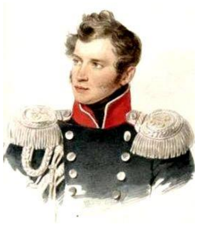
Fig. 1. Aleksandr Grigorievic Stroganov<sup>8</sup>

Finally, again under the authority of the Administrative Council, in 1834, the Bank of Poland took over the entire process of supervising the implementation of further works on the Augustów Canal<sup>7</sup>.